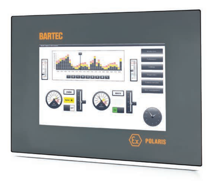
Example of scenario 1: mobile plant monitoring SIEMENS WINCC OA OPERATOR on Tablet PC Agile X and HMI POLARIS SMART 7"