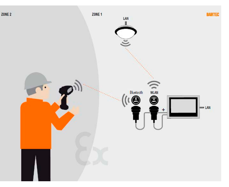
HMI system in Zone 1 with Bluetooth scanner series BCS3678-NI (Zone 2) and connection to the network via Wireless X AP

from BARTEC, it is possible to transfer potentially explosive atmospheres to a uniform automation strategy as required and, with an ideal cost/benefit ratio, achieve sustainable efficiency gains.