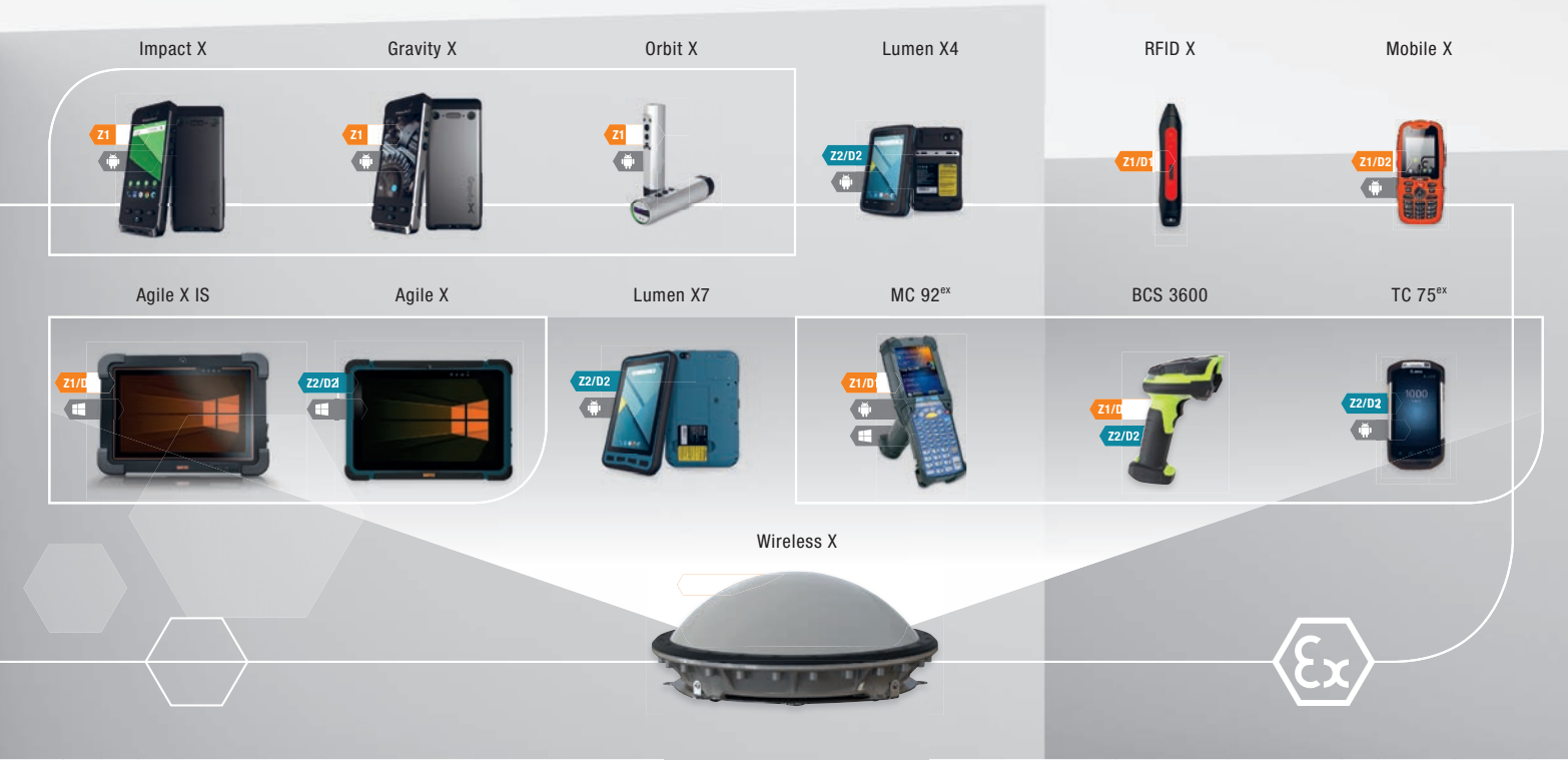
BARTEC Enterprise Mobility Portfolio Overview

3. Infrastructure and accessories. Wi-Fi access points, barcode and RFID scanners with Bluetooth support for the efficient connection to mobile and stationary HMIs are likewise all available from BARTEC. Using these tried and tested components, a range of modern automation scenarios can be achieved to boost the efficiency of operations, reduce investment and maintenance costs and increase process reliability: