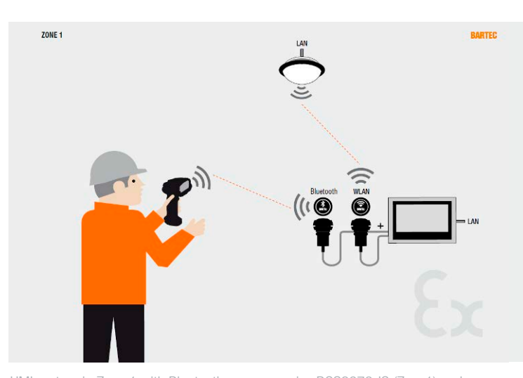
HMI system in Zone 1 with Bluetooth scanner series BCS3678-IS (Zone1) and connection to the network via Wireless X AP.

Feedback signals are alternatively possible with an HMI in Zone 2 that receives its data from a Bluetooth scanner in a fixed position in Zone 1. Existing plants can be retrofitted quickly and cost-efficiently using the BARTEC BCS handheld scanner..