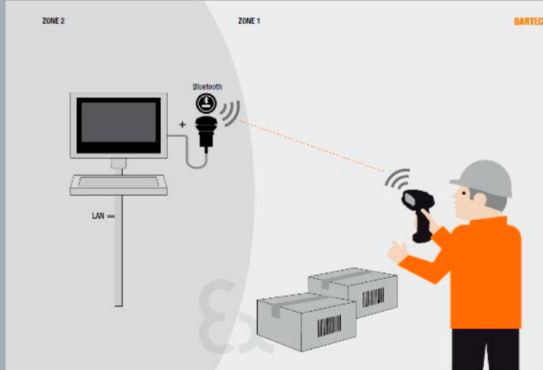
Use Case 4: data capture in Zone 1 using the BARTEC BCS Bluetooth scanner, transmission of data to HMI in Zone 2 (also perfect for retrofitting)